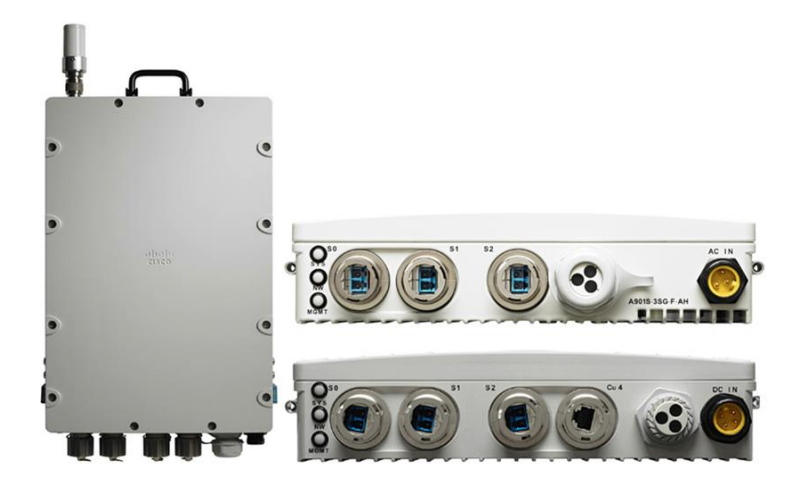
Figure 1. Cisco ASR 901S